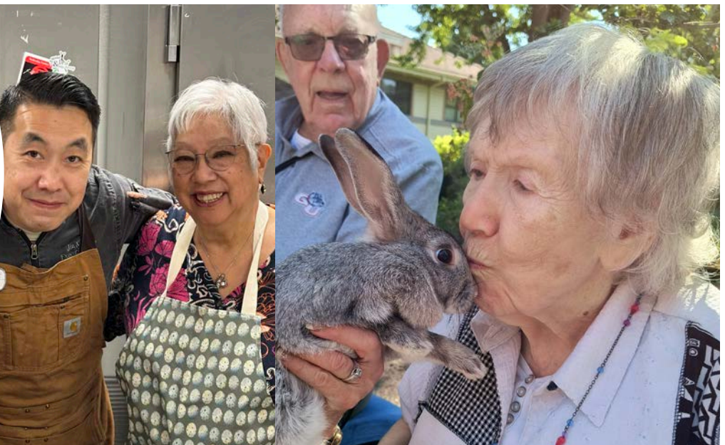
Committed to community involvement and outreach.