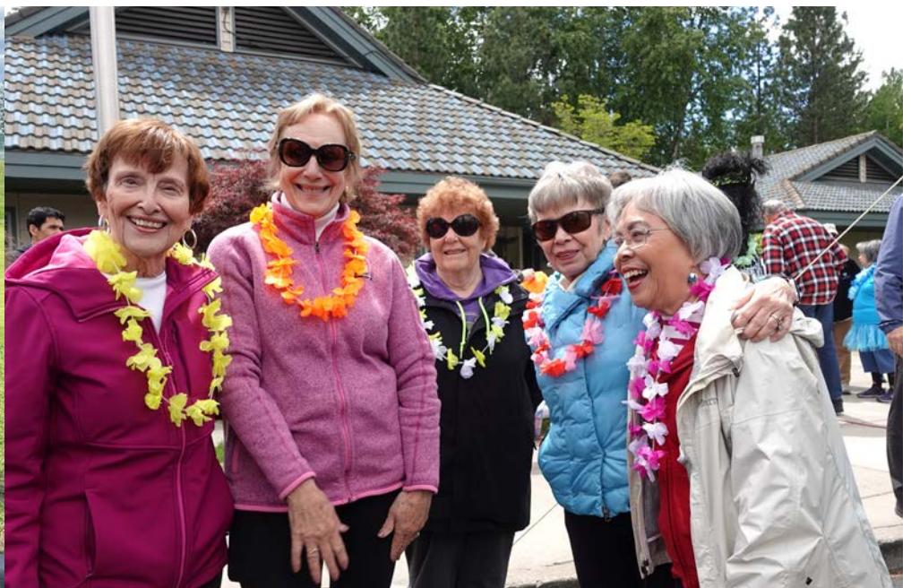
Provide a positive work environment where team members know they are valued.